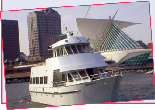
Sailing from Milwaukee harbor, the Princess II is hosting The Milwaukee Outreach Center's benefit dinner and cruise on July 8.

RSVP by calling 414-385-2233. Cost is $75 each person.