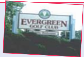
The Evergreen Golf Club is the course for TMOC's 2005 Golf Scramble in August.

This is a shotgun start followed by a deluxe cookout and prizes. Register online at www.acteva.com/booking.cfm?bevaid=87203 . You can also call 414-385-2233 or return your request in the Count On Me! section of this newsletter.